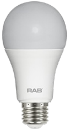
Replace conventional halogen bulbs. Dimmable LED, 80 CRI. Color: White Weight: 0.2 lbs Case Qty: 12