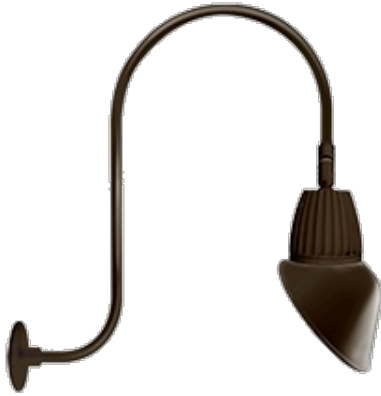
13 & 26 Watt Angled Cone Shade LED Gooseneck Luminaire designed to match the architecture of Main Street storefronts and building perimeters. LED Gooseneck Cone Shade with Upcurve 30" High, 25" from Wall Goose Arm Style 3.