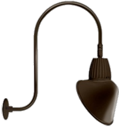
13 & 26 Watt Angled Cone Shade LED Gooseneck Luminaire designed to match the architecture of Main Street storefronts and building perimeters. LED Gooseneck Cone Shade with Upcurve 30" High, 25" from Wall Goose Arm Style 3.