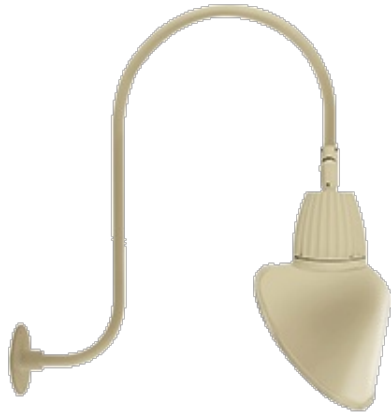
13 & 26 Watt Angled Cone Shade LED Gooseneck Luminaire designed to match the architecture of Main Street storefronts and building perimeters. LED Gooseneck Cone Shade with Upcurve 30" High, 25" from Wall Goose Arm Style 3.