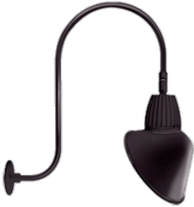
13 & 26 Watt Angled Cone Shade LED Gooseneck Luminaire designed to match the architecture of Main Street storefronts and building perimeters. LED Gooseneck Cone Shade with Upcurve 30" High, 25" from Wall Goose Arm Style 3.