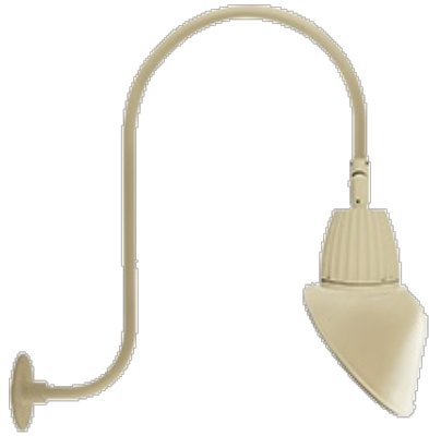
13 & 26 Watt Angled Cone Shade LED Gooseneck Luminaire designed to match the architecture of Main Street storefronts and building perimeters. LED Gooseneck Cone Shade with Upcurve 30" High, 25" from Wall Goose Arm Style 3.