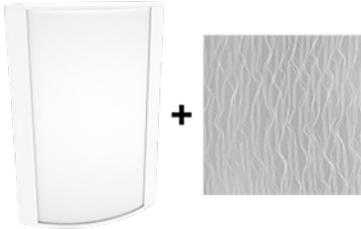
Textured White Frame with Mirage Platinum Lens

Note: Fixture will come fully assembled with the frame and lens shown above.