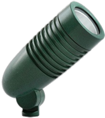
Same small package. Bigger output. Replaces 50W MR16 Floodlight. Color: Verde green Weight: 1.5 lbs