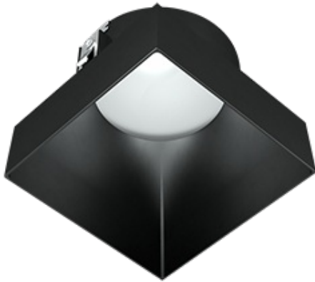
Die-cast aluminum trim cone with high-efficiency TIR optics.