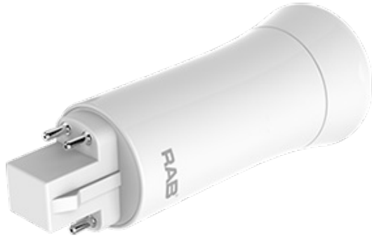
Replace cluster and 3U-pin base compact fluorescent lamps. Color: White Weight: 0.3 lbs