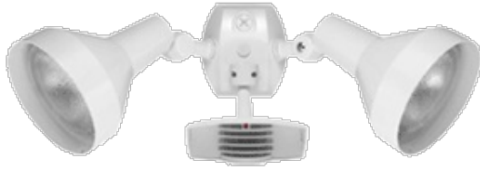
STEALTH Sensor with twin precision die cast H101 Deluxe shielded floods pre-wired and assembled on universal CU4 cover plate.