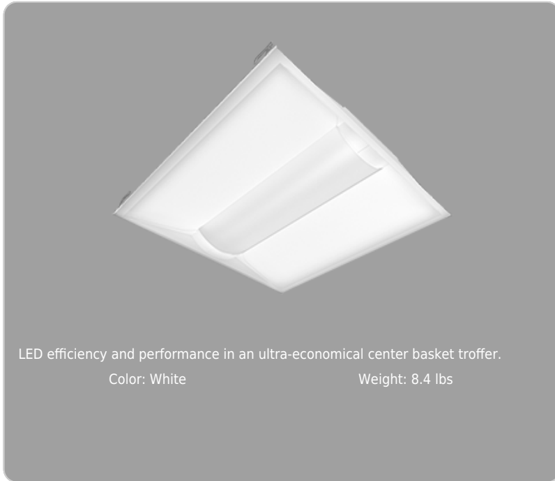
LED efficiency and performance in an ultra-economical center basket troffer. Color: White Weight: 8.4 lbs