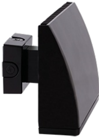
LED 52W Wallpacks. 3 cutoff options. Patent Pending thermal management system. 100,000 hour L70 lifespan. 5 Year Warranty.